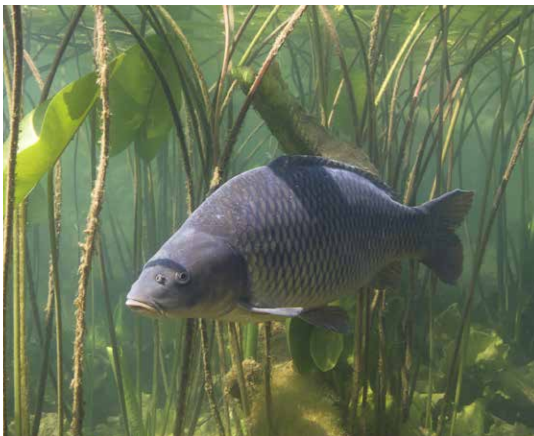
European Carp ( Cyprinus carpio )

The National Carp Control Plan will set out a considered approach to safely manage the potential release of carp virus by the end of 2018, as part of an integrated approach to control carp in Australia's inland waterways.