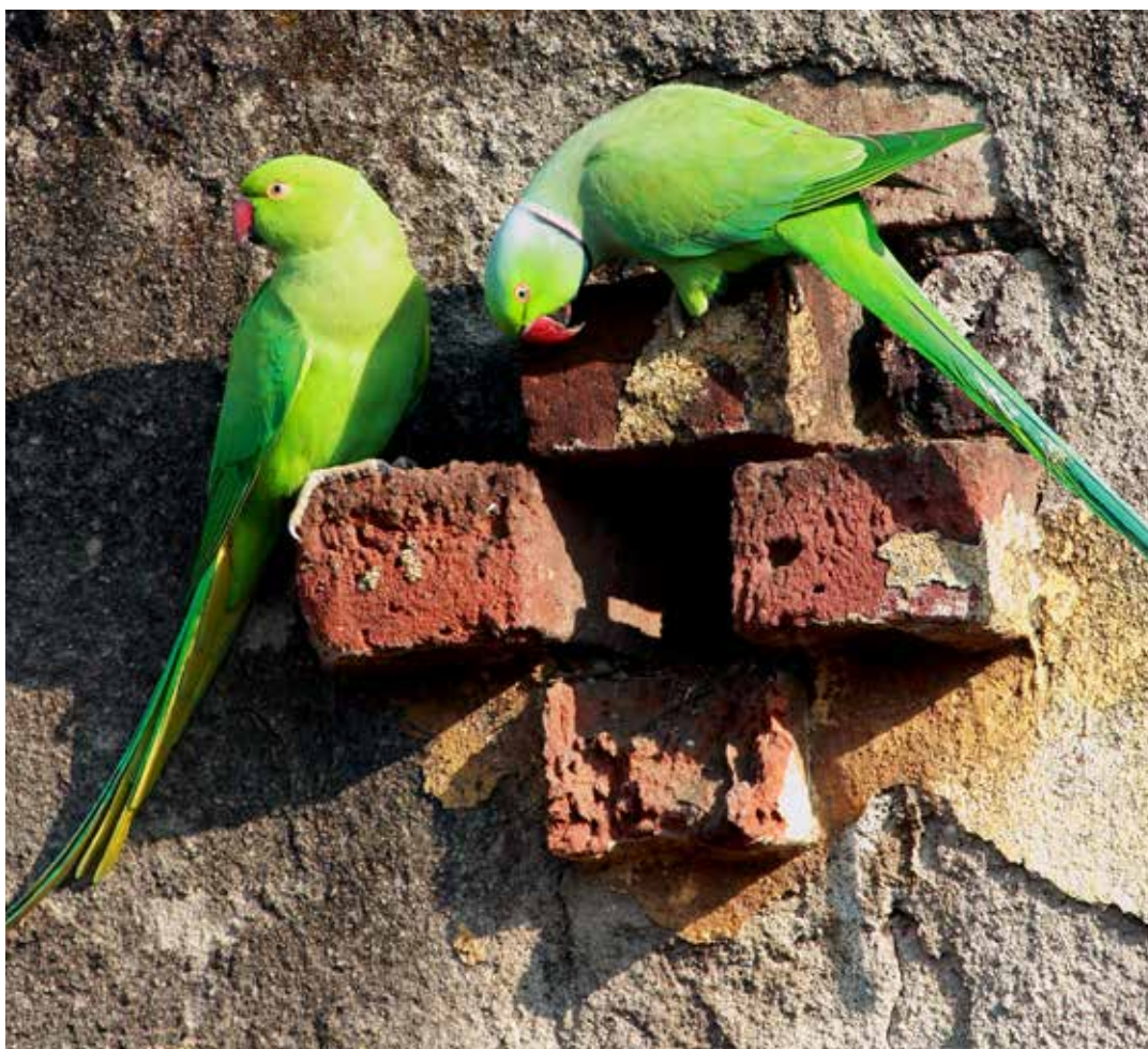
Rose-ringed parakeets ( Psittacula krameri )

The Invasive Plants and Animals Committee (IPAC) has oversight of the APAS and will use the strategy to guide the development of its annual workplan.