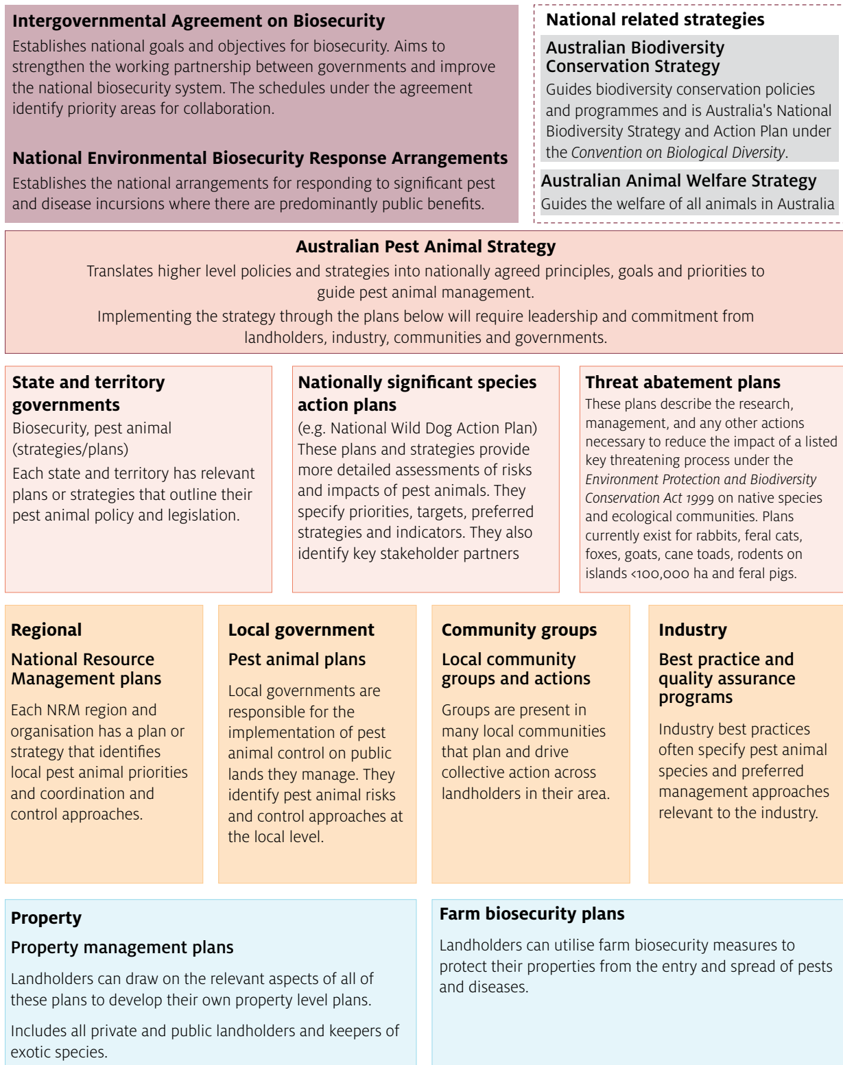
FIGURE 2 Context for the Australian Pest Animal Strategy