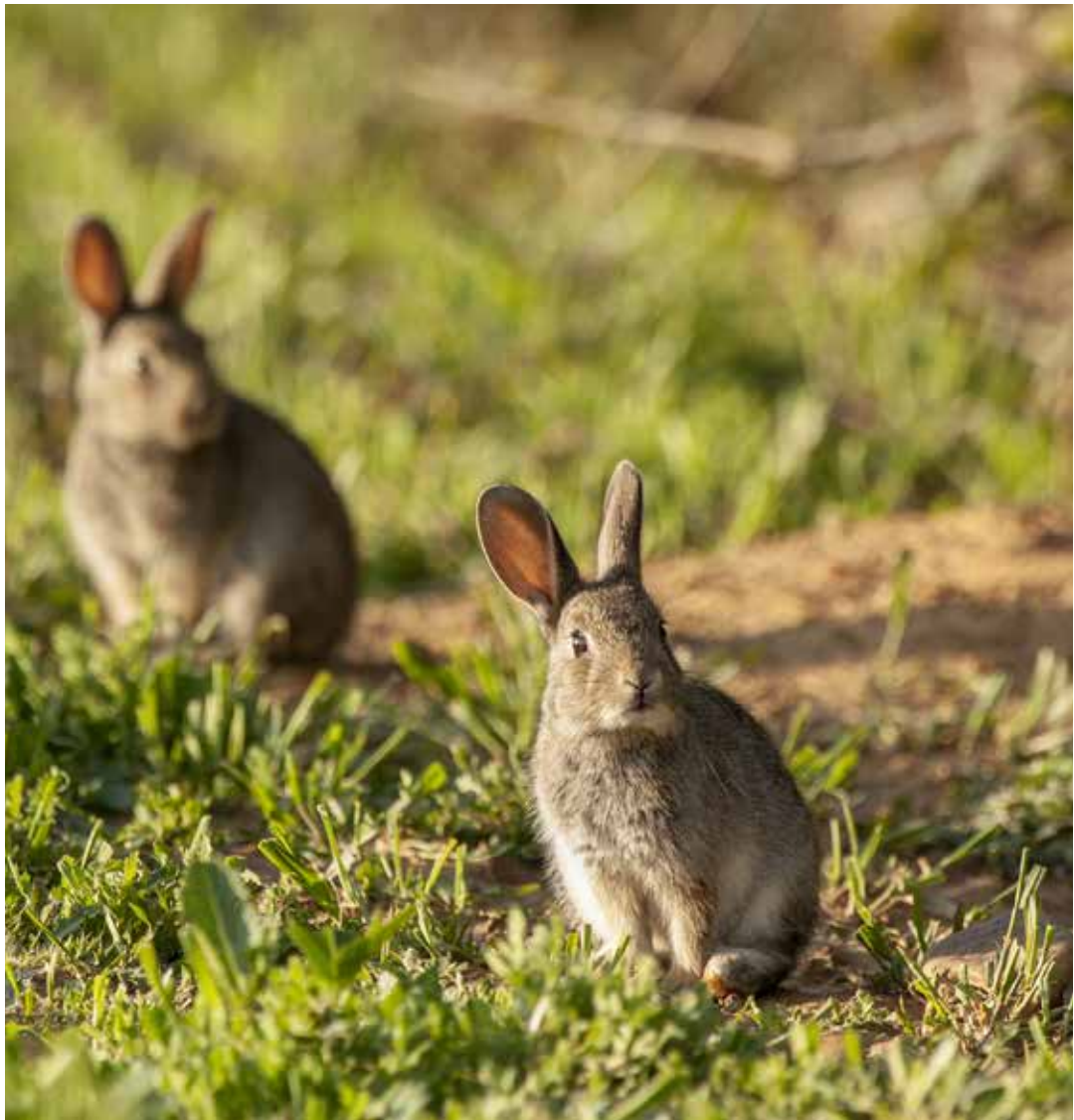
European rabbit ( Oryctolagus cuniculus )

Pest animal control methods often take years to develop, and require specialist scientific skills and capabilities. To deliver the control methods of the future it is important that research, development and extension activities, and associated funding arrangements are maintained with a long-term focus. Rabbit biological control is a great example of the importance of ongoing long-term commitment to research, development and extension.