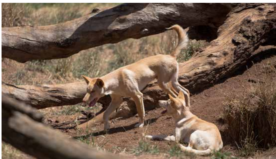
Wild dogs ( Canis familiaris )

It sets out four goals to achieve this with clear actions under each for a wide spectrum of stakeholders. Importantly, the plan identifies who is responsible for actions, and the resources, priorities and timeframes; as well as identifying the monitoring, evaluation and reporting requirements associated with the plan, including standard measures of impacts, management efficacy, and cost effectiveness relevant to all parties.