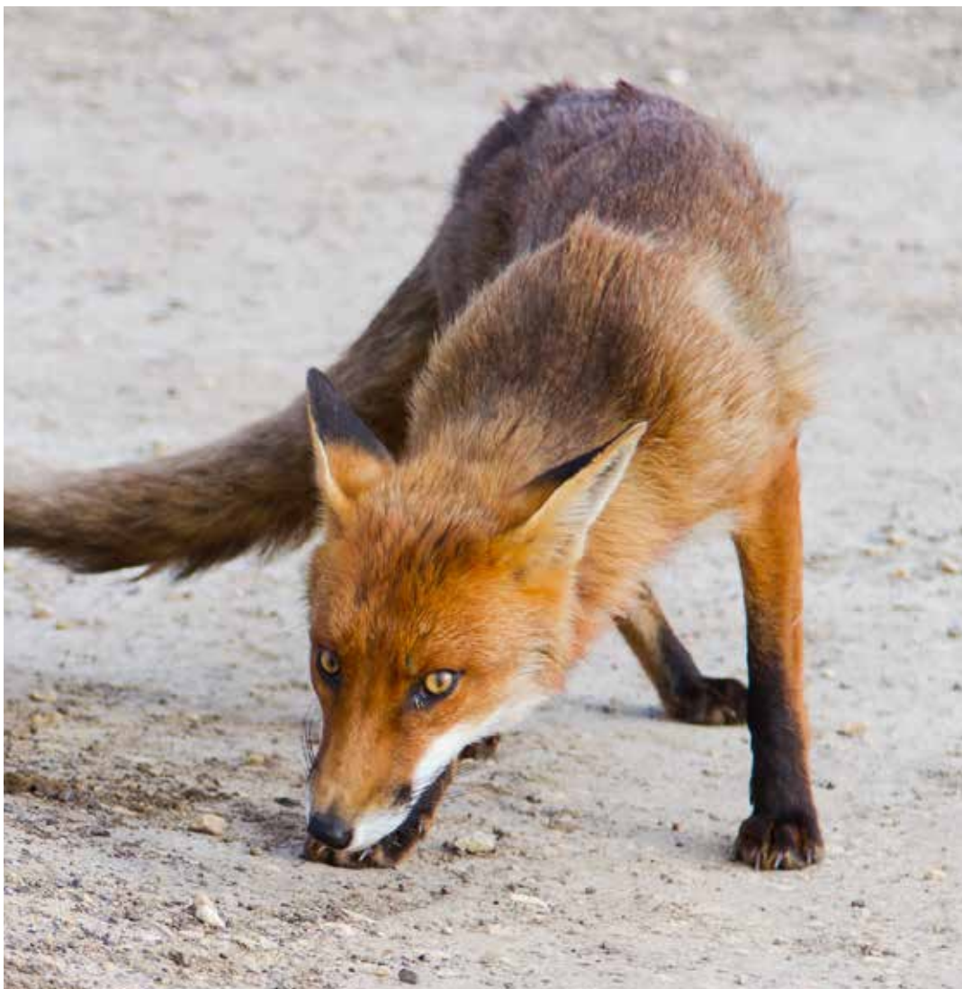
Red fox ( Vulpes vulpes )

The CoPs and SOPs are a great development in pest animal management. They should be continuously improved as new information becomes available, to ensure that the most effective, safe and humane control practices available are being delivered by landholders.