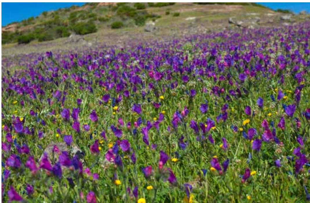
Paterson's curse ( Echium plantagineum )