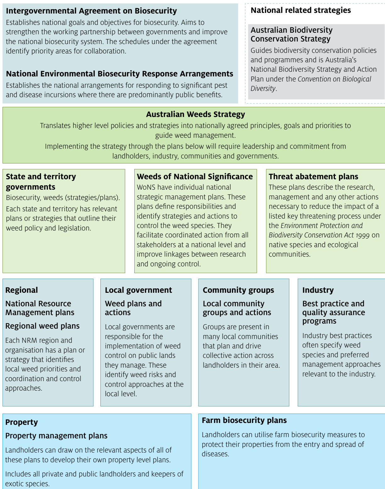
FIGURE 2 Context for the Australian Weeds Strategy