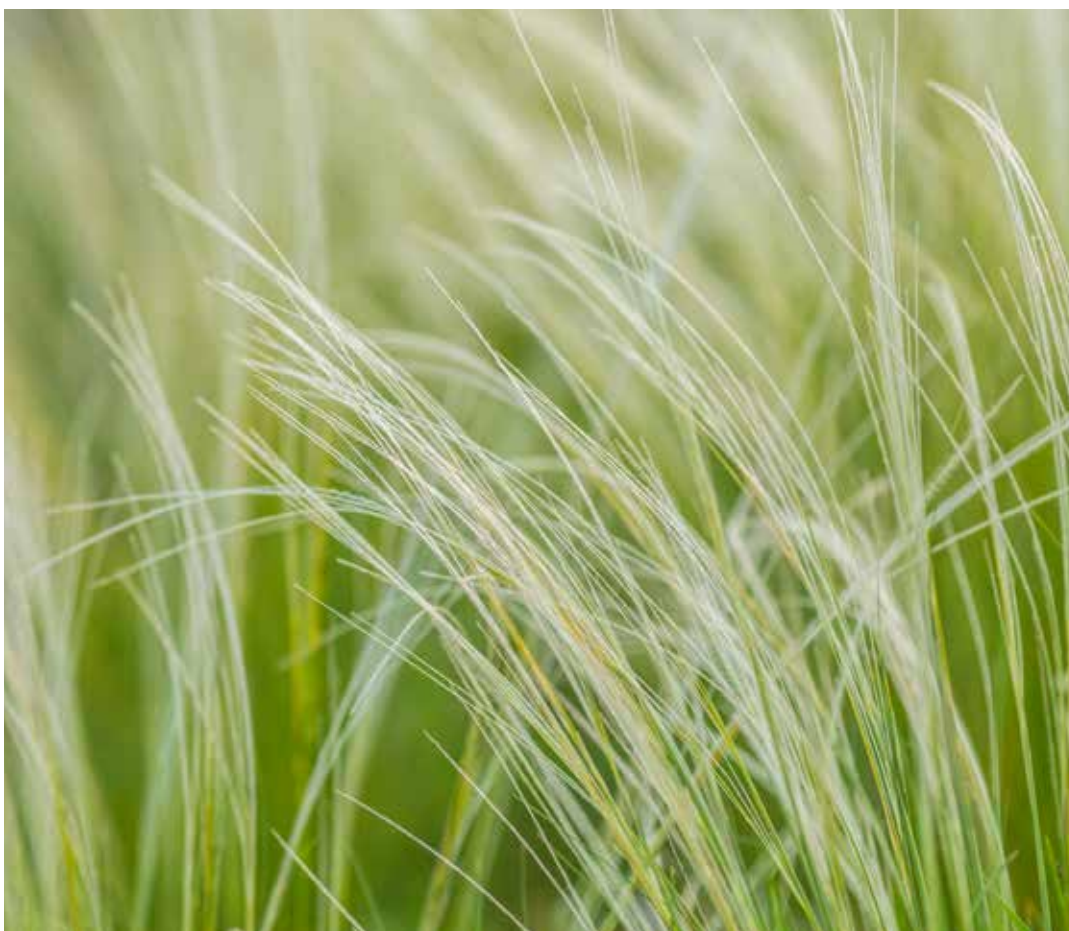
Mexican Feather Grass ( Nassella tenuissima )

Working with suppliers and building public awareness about the risks associated with purchasing seeds and bulbs online is important to ensure that potentially invasive plants such as Mexican Feather Grass do not enter Australia.