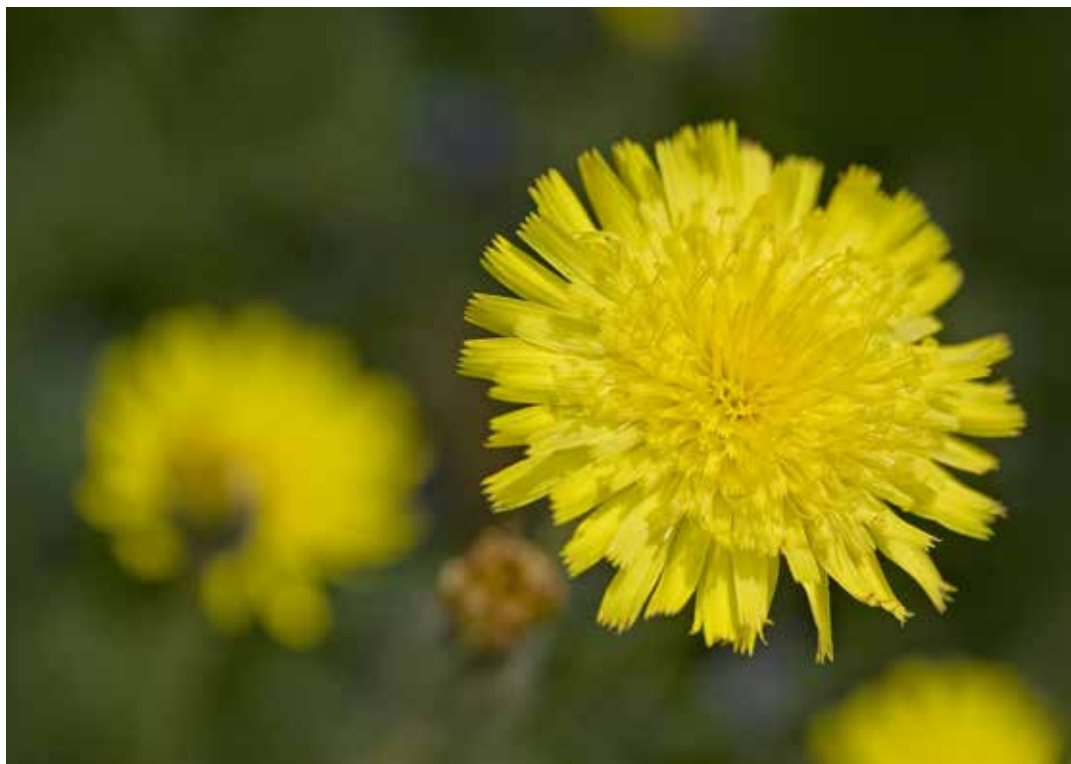
Mouse-ear hawkweed ( Hieracium pilosella )