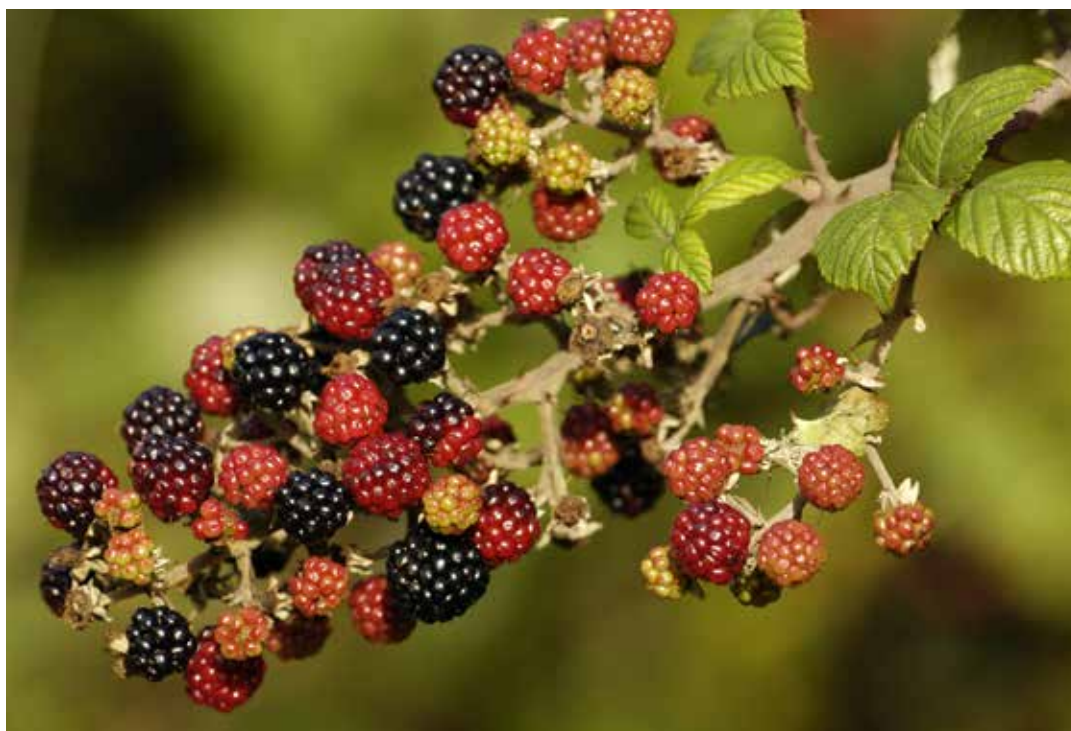
Blackberry ( Rubus fruticosus )